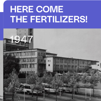
HERE COME THE FERTILIZERS!