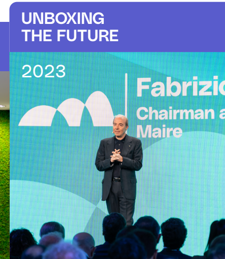
UNBOXING THE FUTURE