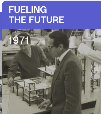
FUELING THE FUTURE