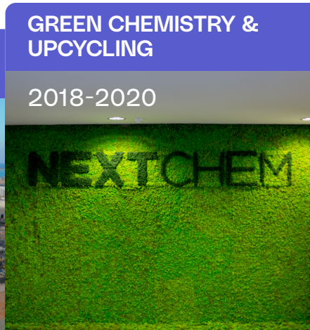
GREEN CHEMISTRY & UPCYCLING